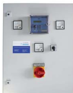
Kompaktschaltschrank LCD2 - System Metall