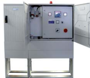
Kompaktschaltschrank mit Noteinspeisung und EVU-Anschluß