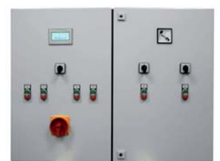
PLC TOUCH-System Kompaktschrank