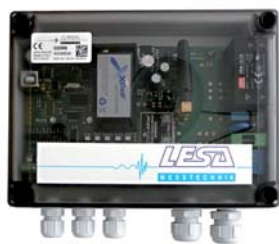
LESA- GSM 8