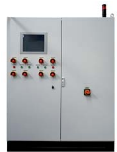
PLC TOUCH Grossanlage